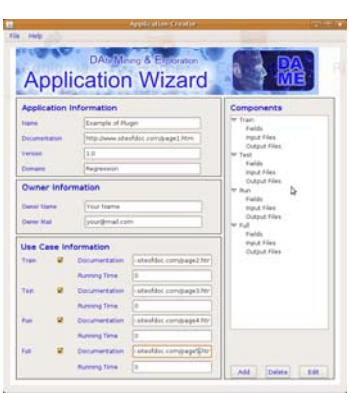
The project is based on five main components: Front End (FE), Framework (FW), Registry and Data Base (REDB), Driver (DR) and Data Mining Models (DMM), plus an application plugin wizard for source code generation

It is a web oriented and VO aware suite. In order to perform data mining and exploration experiments, we have considered a topdown strategy, starting from the taxonomy of data mining and research functionalities which are associated to specific algorithms and processing methods. In the first release, the suite offers tools for the following functionalities: